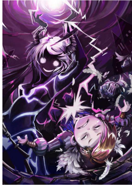
Show your real ability in the "Nighttime"! Release all the "Energy" collected and perform a huge attack towards the Angels.